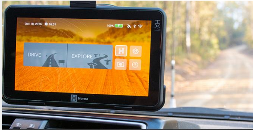
Hema HX-1 Navigator: On & Off-road GPS