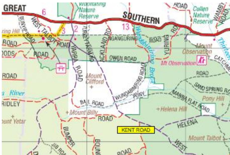
Kent Rd / Talbot West Rd meeting place